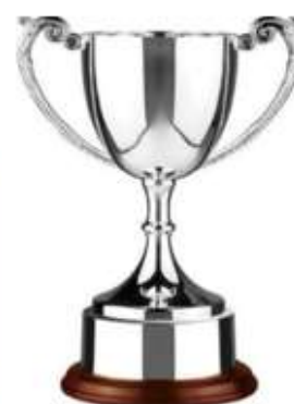
The Isobel Campbell MBE Memorial Trophy (presented by GNCC)