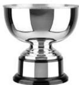
CTT Scotland District 10tt Championship Bowl (presented by CTT Scotland)